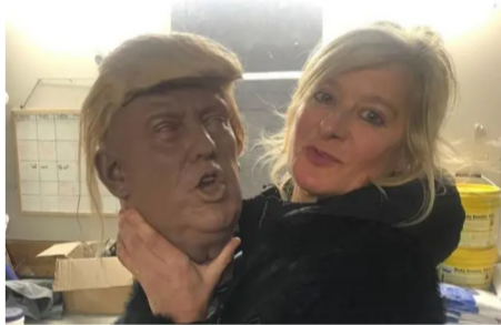
An award-winning artist is appealing for help after losing a bespoke Donald Trump wig

"That wig is part of his stardom, and probably Donald Trump's himself."