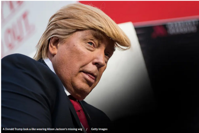
A Donald Trump look-a-like wearing Alison Jackson's missing wig