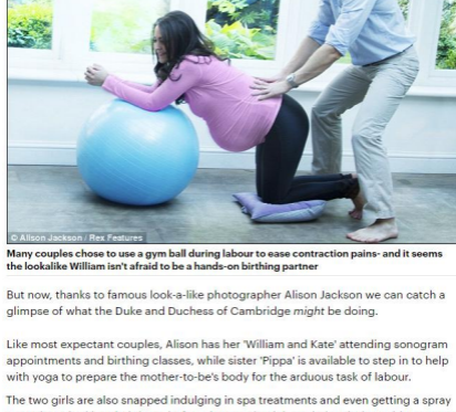
Many couples chose to use a gym ball during labour to ease contraction pains- and it seems the lookalike William isn't afraid to be a hands-on birthing partner