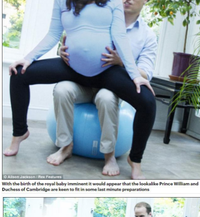
With the birth of the royal baby imminent it would appear that the lookalike Prince William and Duchess of Cambridge are keen to fit in some last minute preparations

Little is known of the planning, preparation and day-to-day build up for the royal birth that is going on behind the guarded palace walls.