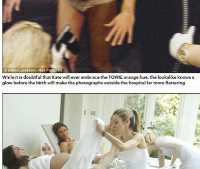
While it is doubtful that Kate will ever embrace the TOWIE orange hue, the lookalike knows a glow before the birth will make the photographs outside the hospital far more flattering