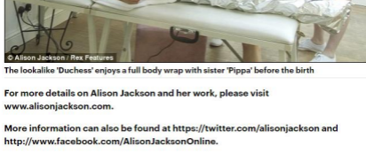
The lookalike 'Duchess' enjoys a full body wrap with sister 'Pippa' before the birth