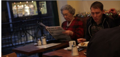
Greasy spoon? I'm more used to a silver spoon, thank you, but it's a good place to pick up a few tips.