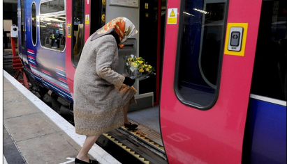
The real Queen: Her Majesty took the public commuter train up to Norfolk last week