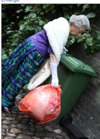
Left: Love these things - it's so nice to see a friendly face. Mine! Right: When they said put the old bag out, I thought they meant Camilla