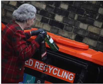
There were more of these when one's sister was around