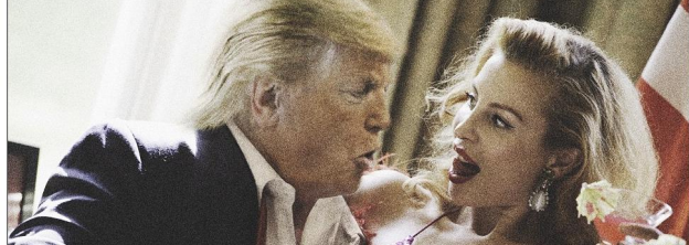
Photos from the project were released only days before the general election and one depicts the Donald seducing a woman at work

The Republican candidate also dons some very dodgy military regalia in Jackson's impression, released in her new book Private.