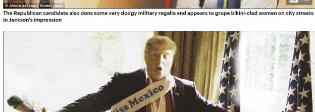
The renowned celebrity artist, 46, has set up a series of spoof photos using real-life lookalikes of The Donald. Pictured: A Donald lookalike at the launch of Jackson's book today