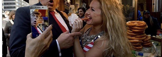
One snap shows a Donald lookalike entertaining some groupies in the city streets at the book launch