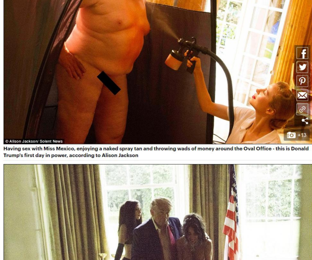
Having sex with Miss Mexico, enjoying a naked spray tan and throwing wads of money around the Oval Office - this is Donald Trump's first day in power, according to Alison Jackson

One snap shows him being sprayed by an aide fully nude as he tops up his infamous tan, while another depicts a raunchy scene on the desk of the Oval Office with Miss Mexico as Jackson gives a glimpse of what life could be like inside a Trump White House.