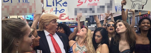
One snap showed the Republican candidate posing for selfies with models in the artist's impression