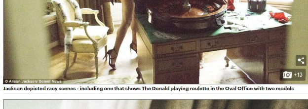
Jackson depicted racy scenes - including one that shows The Donald playing roulette in the Oval Office with two models