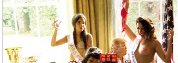
The impression shows lookalikes posing for selfies with world models with a 'make America great again' phone case